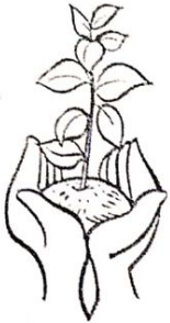
Stakeholder consultations on Community Forest Management

Eversince it has been proposed to consider a shift from the ongoing Joint Forest Management to Community Forest Management, extensive discussions are going on, among all those who have been actively involved in the programme. The following are the concerns frequently expressed: