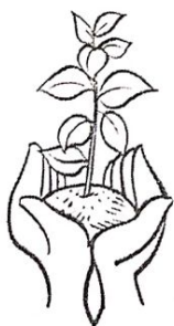
Stakeholder consultations on Community Forest Management

It is in this background; the consultation process has been attempted. The understanding thus emerging is that – Community Forest Management is a Forest Management model, which enables the people living in Forest fringe areas to manage the designated forests as well as their livelihoods in a sustainable way. It may be reviewed and further evolved from time to time based on experiences. The role of foresters and NGOs will be of guiding and facilitating rather than controlling and regulating.